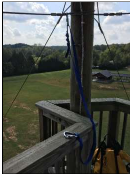
Extra participant tether shown on the cable at the