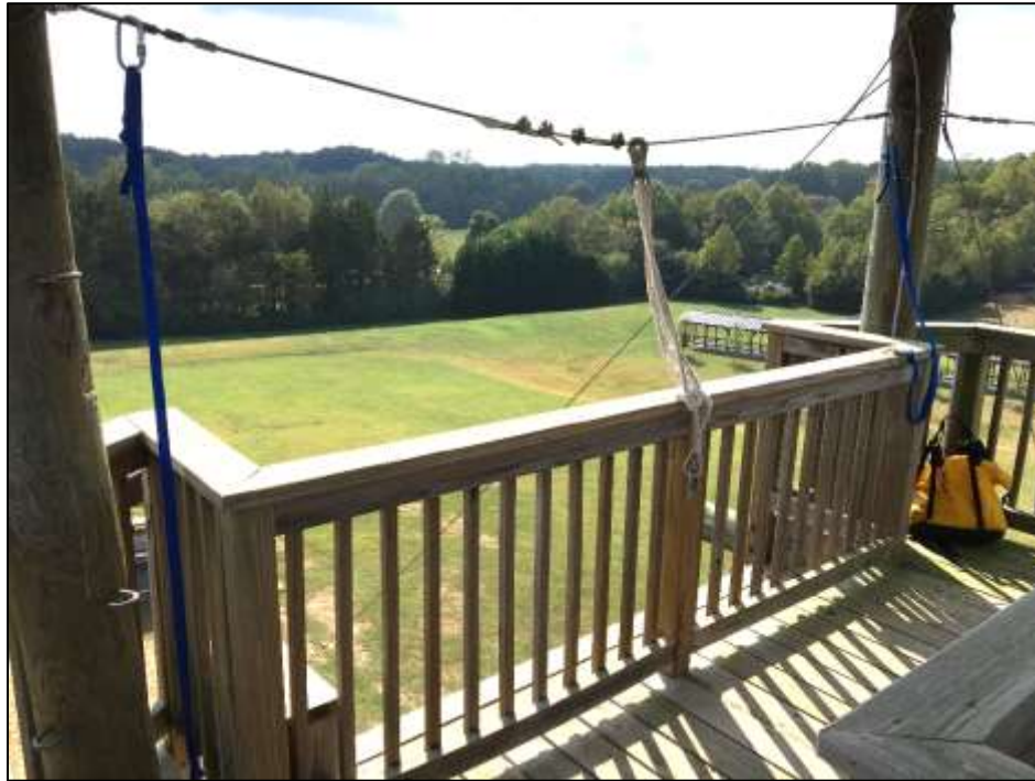
Instructor and participant tethers for rappel at the Belk tower.

When not in use the tether can be left hanging. Never clip the participant end of the tether to a staple on the pole. The staples are NOT life safety rated and a tether must never be clipped to a staple. It is also recommended that a tether not be clipped to the overhead cable. If an aluminum carabiner is on one end of the tether the instructor might inadvertently leave this clipped to the steel cable and attach the participant to the steel carabiner.