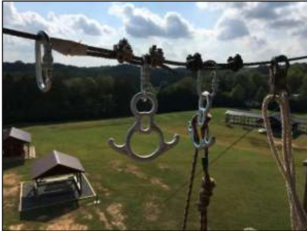
Notice the relative positions of each rigging element on the separating cable clamps.

Make a bite of rope at the midpoint and place it through the rescue 8 and over the top of the 8. Once this is done you can hang the 8 on the tower cable using a steel carabiner to make it easier to tie the rest of the rig. The rescue 8 should be attached to the cable between the left most pair of clamps.