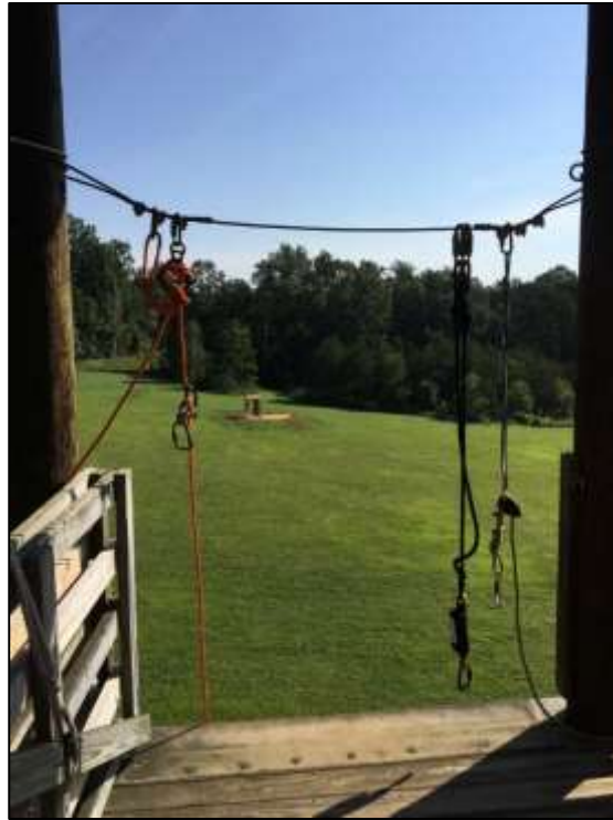
Complete rappel rigging at MSR including all tethers. Note the participant tether is just on the left leaning against the railing.

Gloves for the participants can be placed on the main platform where the instructor can reach through the railings to pick them up. This is better than having gloves on the rappel platform where they can become a tripping hazard or inadvertently kicked over the edge of the tower. At MSR we often keep the gloves in the gear bucket on the platform of the tower to the right of the top of the stairs.