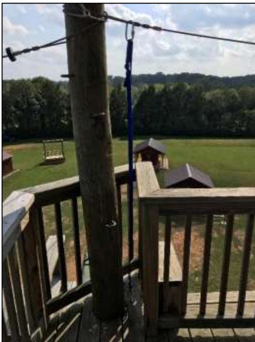
Primary participant tether for rappel at the Belk

When the rappel participant climbs up the ladder he/she should be attached to the secondary tether. This is also a useful "on deck" position for the next rappeller in line. He/she can watch the rappel process and become comfortable with the top of the tower. When the participant is ready to move to the primary rappel position tether, the participant should be attached to the primary tether before being taken off the secondary tether. If the webbing used for the tethers is 15' and the tethers are attached to the cable inside the two triangles, then the two tethers should meet in the middle to allow for this transfer.