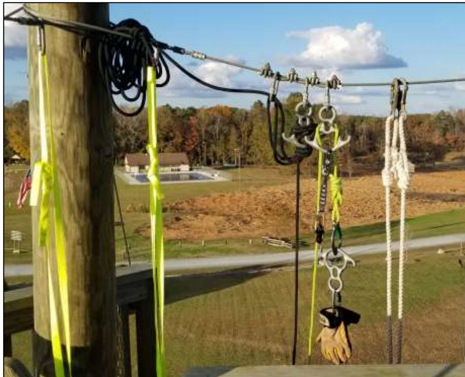
Complete rigging at Belk on the north face rappel route.

At MSR the release line for the rappel can be placed over the railing on a small wooden ledge. You cannot see the rope on the ledge in the picture below however you can see the orange release line passing over the wooden railing to the left.