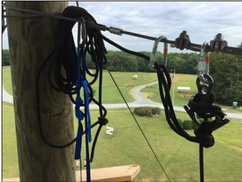
Releasable rappel on the north face of the Belk tower with the releasable line coiled and placed over the cable triangle.