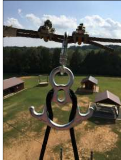
The rappel rope has been fed through the rescue 8 at the rope midpoint and the steel carabiner has been screwed closed.

Determine which end of the rope will be the rappel line and which will be the release line. At Belk it is easiest if the rappel line is the right line. The steps and pictures demonstrate this right line approach. However, you can rig the rappel either from the left or the right, it does not make a difference to the rappel application. Throughout this process you only manipulate the release line. The rappel line hangs inert through all steps of tying this releasable rappel.