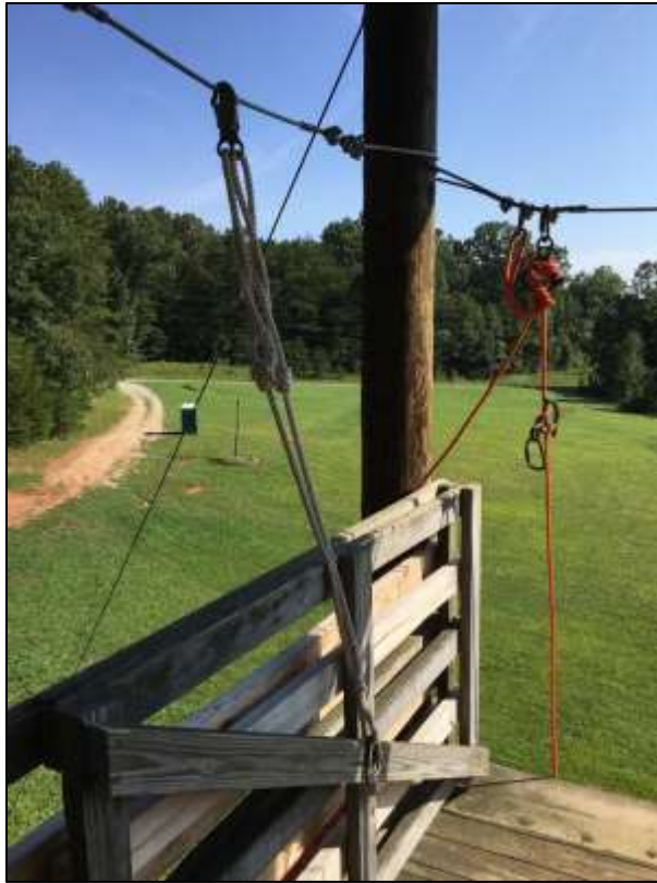
The rappel platform at MSR showing the participant tether on the left and the rappel line in orange.