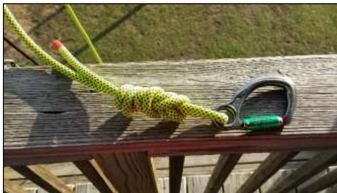
Captive eye carabiner tied with a figure 8 on a bite and properly backed up.

To rig the top rope belay you must use one of the dedicated 50ft lengths of dynamic rope. A tri-action captive eye carabiner should be tied into both ends of the belay line using a figure 8 on a bite with appropriate backup. We use a steel rescue 8 as the belay device for the top rope belay. Once the rope has been tied, pass a bite of rope through the steel rescue 8 and clip the rescue 8 into a steel carabiner. This steel carabiner should be positioned in between the right most set of separating clamps on the cable.